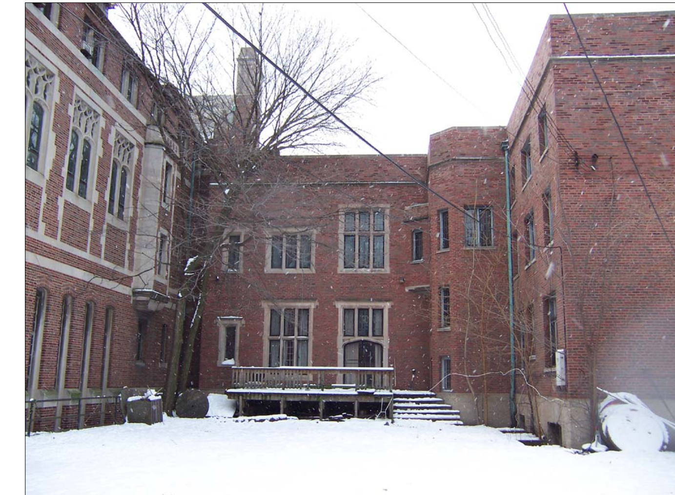
4 PHOTO - VIEW LOOKING WEST