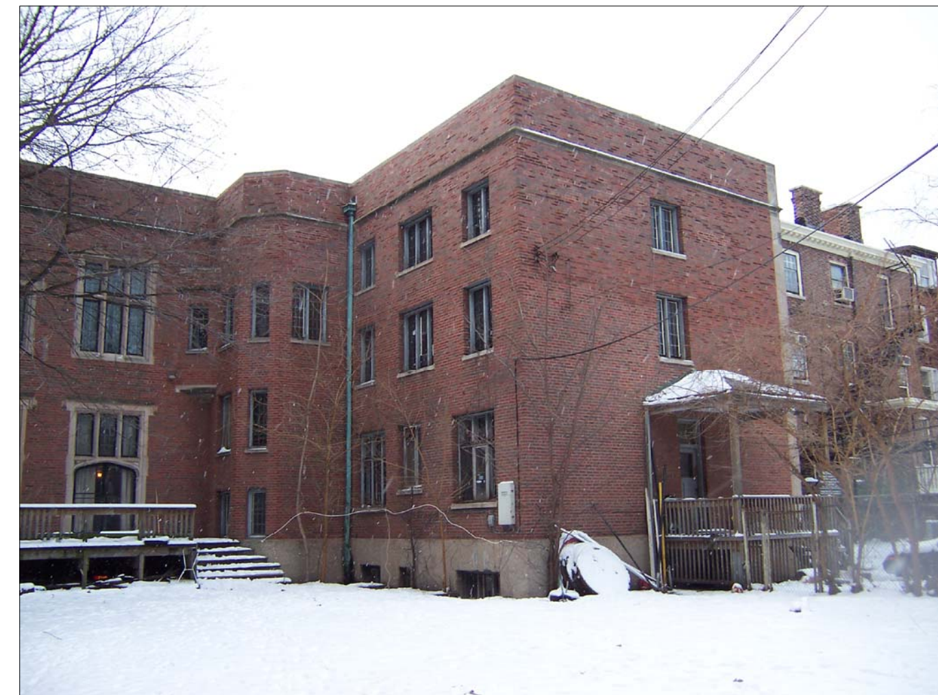
3 PHOTO - VIEW LOOKING NORTHWEST