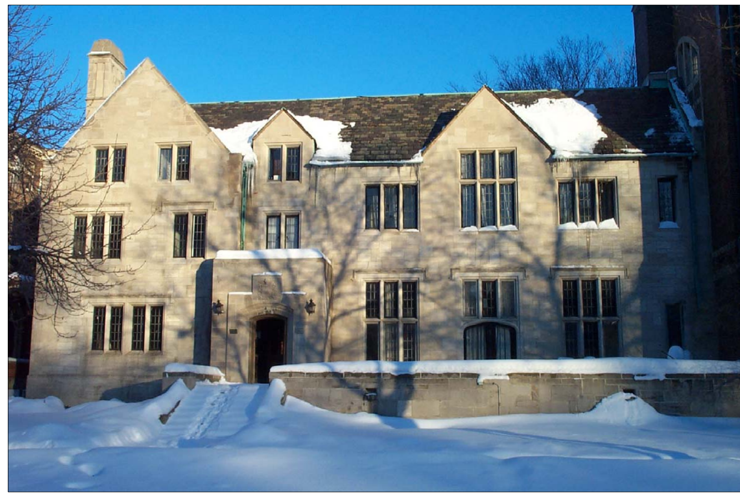
1 PHOTO - VIEW LOOKING EAST