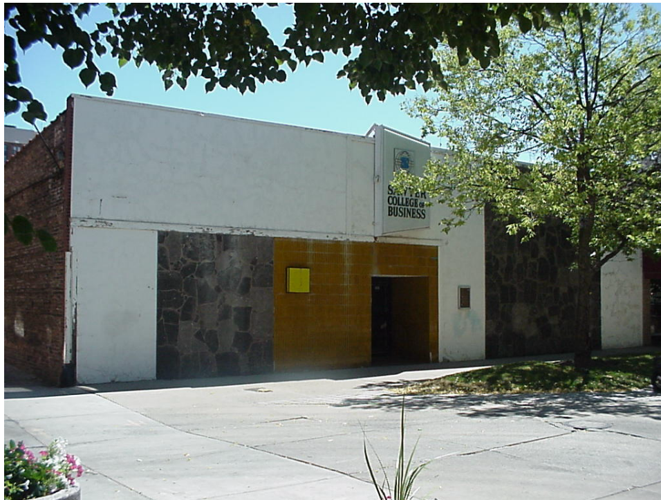
126 N. Marion on the left and 130 N. Marion on the right

The building is 1 story and is 32.5' x 160'. The walls and the foundation were originally brick. The building was remodeled with stucco, rubble stone and ceramic tile in 1960s. There was a rear addition in 1930 and a new storefront in 1934 combined with 130 N. Marion.