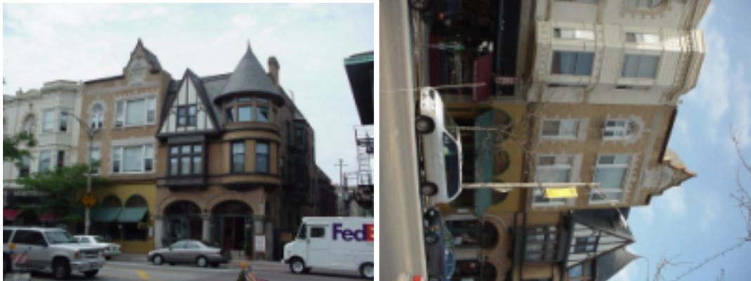
113 N. Oak Park second from right in photo

The brick building is 3 stories with stone window surrounds and arched window on third floor. Decorative gable at cornice. There were storefront alterations. Two-story bay removed after late 1930s per photos.