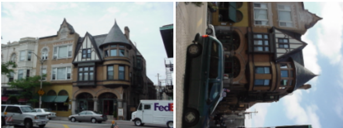
115 N. Oak Park on right in photo

The brick building is 3 stories with second story brick bay below a half-timbered gable. Corner turret on second and third floors. First floor arched openings with stone columns. The building was remodeled in 1925 by Roy Hotchkiss and was a rooming house in 1930. Underwent restoration in 1981.