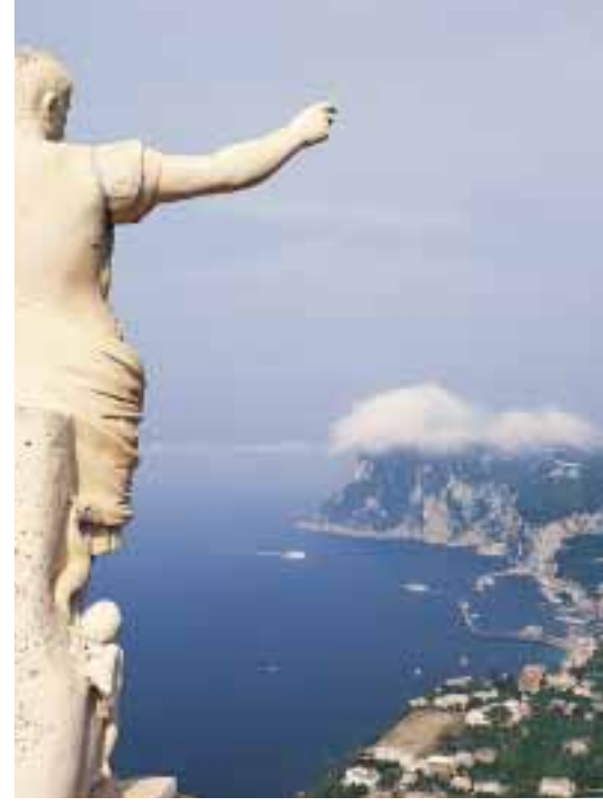
Behold the Isle of Capri!

Guided sightseeing of Rome • Visit the mighty Colosseum, where as many as 50,000 cheering spectators would flock to watch gladiator battles unfold inside. Then stroll through the grassy ruins of the ancient Forum Romanum, once the heart of the Roman Empire, and admire the enduring fragments