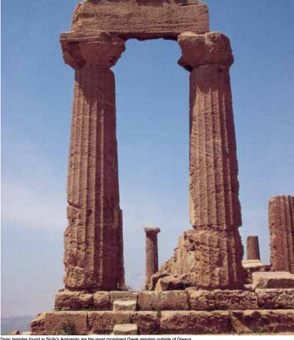
Doric temples found in Sicily's Agrigento are the most prominent Greek remains outside of Greece.

Learn before you go www.eftours.com/pbsitaly