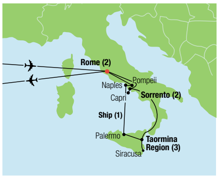
Number of overnight stays in parentheses.

Transfer to Sicily • By way of a ferry crossing from Villa San Giovanni to Messina, transfer to age-old Sicily, a Mediterranean island steeped in mythology. Spend the night in the Taormina region.